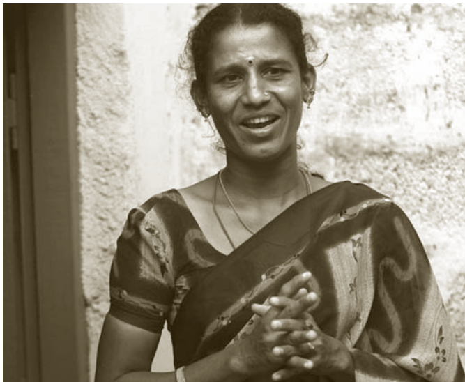
Date original created: 28 March 08 Country: India

However, in the last decade or so, activists in the women's movement have been advocating for the need to address gender issues, including violence against women, in the fight against HIV&AIDS. As more and more women and girls have contracted the disease and its sociocultural and human rights implications have become more widely known, awareness of the linkages between the pandemics has increased. Promising practices facilitate linkages between advocates and activists within the two movements, and strengthen their capacity to work together.