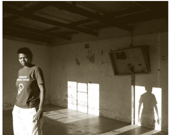
Jodie Bieber/ActionAid Date original created: 26 January 09 Country: South Africa

The remaining chapters lay out four broad strategies for confronting the intersection of VAWG and HIV&AIDS that emerge from the profiles. Chapter 2 illustrates the importance of involving multiple stakeholders, from men and boys to families and social networks, in strategies to confront the twin pandemics as a means of fostering community mobilization and support. Chapter 3 focuses on the importance of involving marginalized groups in and throughout the programme cycle, from design and implementation to monitoring and evaluation, and examines the ways in which organizations are addressing the impacts of race, class, sexual orientation and age in their work at the intersection of the dual pandemics. Chapter 4 looks at innovative models of health care that integrate sociocultural factors in their care and support, while Chapter 5 examines strategies for using research, advocacy and documentation to hold policy makers accountable. The report closes with five recommendations that emerge from the promising strategies profiled. These recommendations are aimed at governments, civil society groups, individuals and others who might consider similar strategies in their own programming efforts to confront the intersection between VAWG and HIV&AIDS.