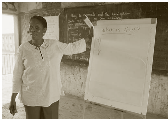
Country: Nigeria

Together We Must! is organized around four broad-based strategies for tackling the intersection: community mobilization to transform harmful gender norms; engagement of marginalized groups that are often more vulnerable to the twin pandemics; development of integrated approaches to support and care; and advocacy for greater accountability among funding agencies and policy makers. Together, these strategies offer valuable lessons and promising practices for