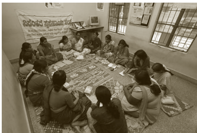
Date original created: 28 March 08 Country: India