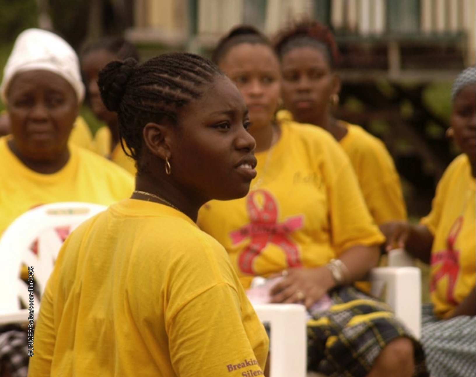
Women from the community based group "POWA" during the project "Aids Friendly Towns", supported by UNICEF in Belize.