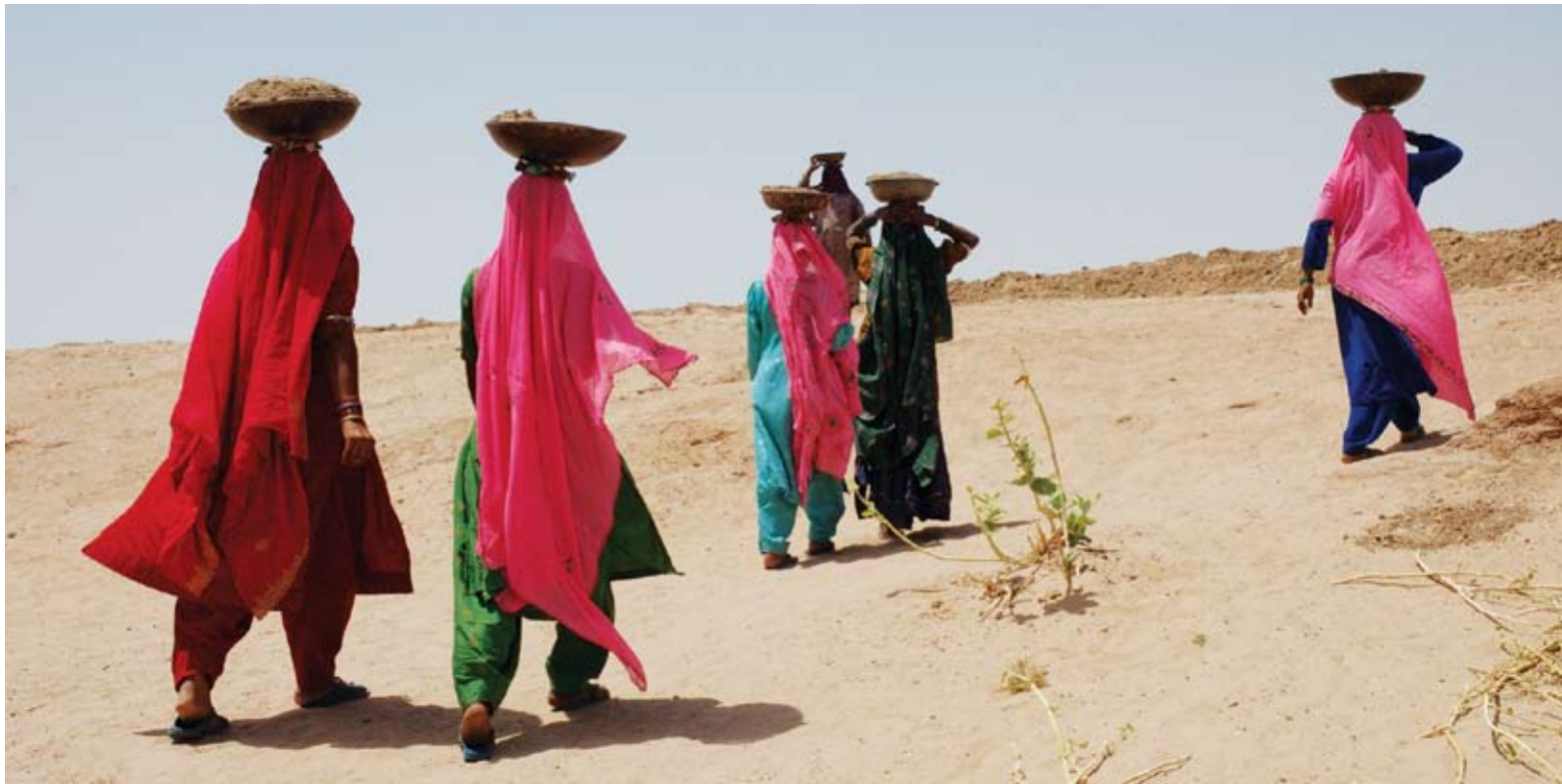
2005 | Diego Goldberg | Pixel Press | UNFPA