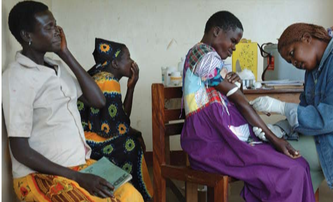
2005 | Diego Goldberg | Pixel Press | UNFFPA