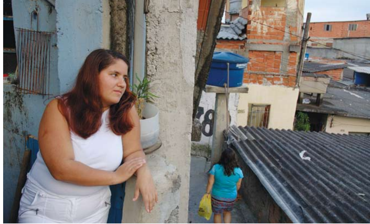
2005 / Diego Goldberg / Pikel Press / UNFFPA