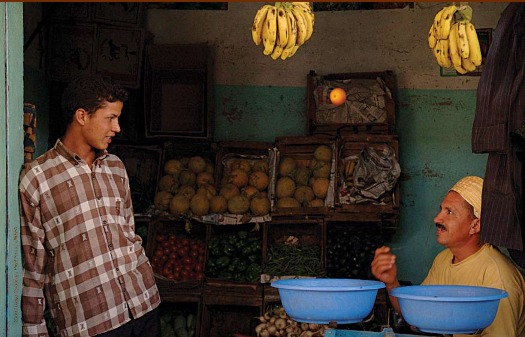
2005 | Diego Goldberg | Pixel Press | UNFPA