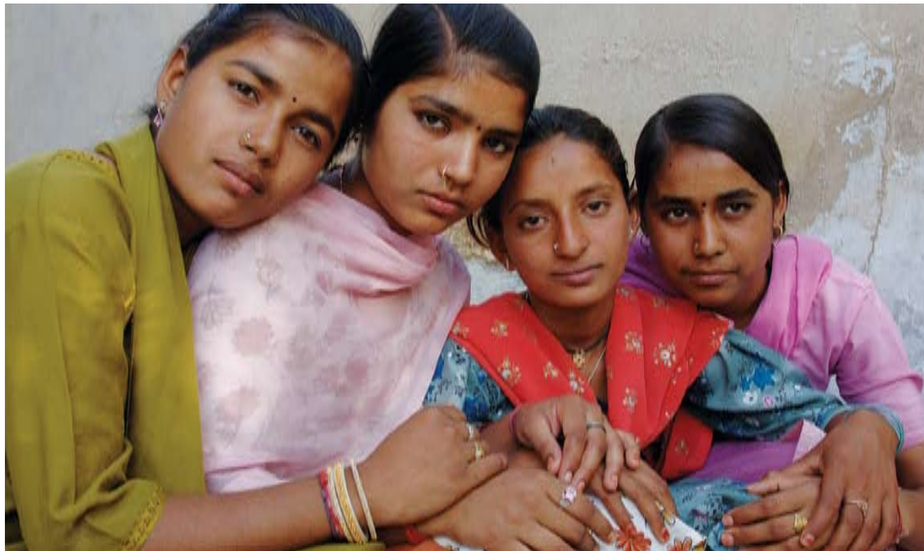
2005 | Diego Goldberg | Pixel Press | UNFPA