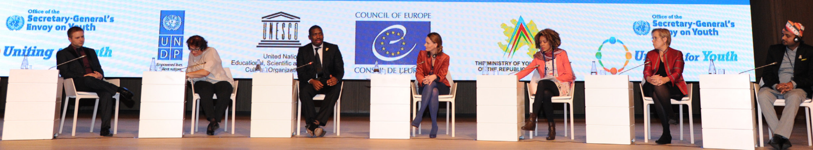
The First Global Forum on Youth Policies, held in October 2014 in Baku, Azerbaijan, and a Youth Policy Labs seminar held in Berlin, Germany, in 2015