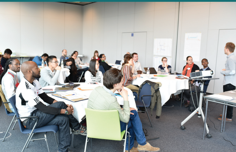
Our Global Young Researchers Lab, held in Berlin, Germany, 2015